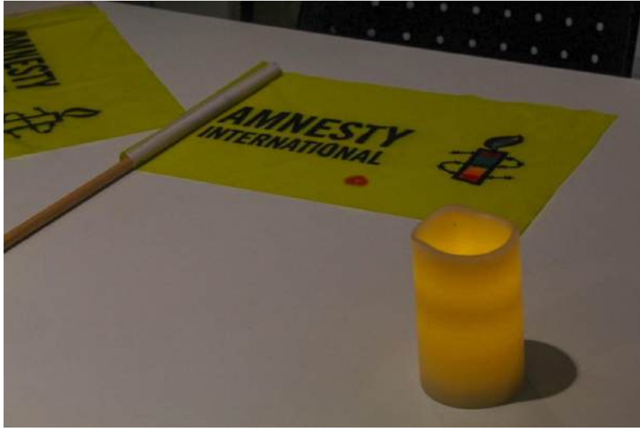
Marking International Human Rights Day, 10 th December, AMNESTY Letterkenny lights vigil candles at reception of attendees at the start of the event