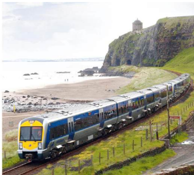
TRANSLINK train Belfast – Derry/Londonderry line

International Guests left Belfast by train and Conflict Textiles trustees joined on their way at different stations to arrive into Derry-Londonderry at 10.20