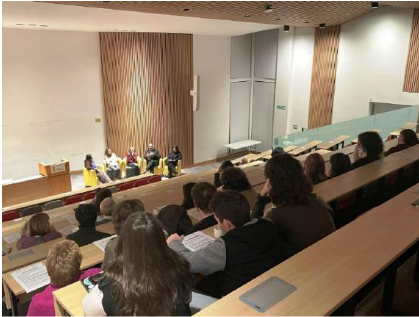
View of the theatre: panellists and audience